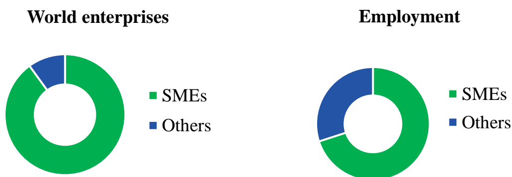
Fig. 1. ILO statistics on a global scale, regarding the number of SMEs and other enterprises

ILO statistics on a global scale, regarding the number of SMEs and other enterprises. (Fig. 1)